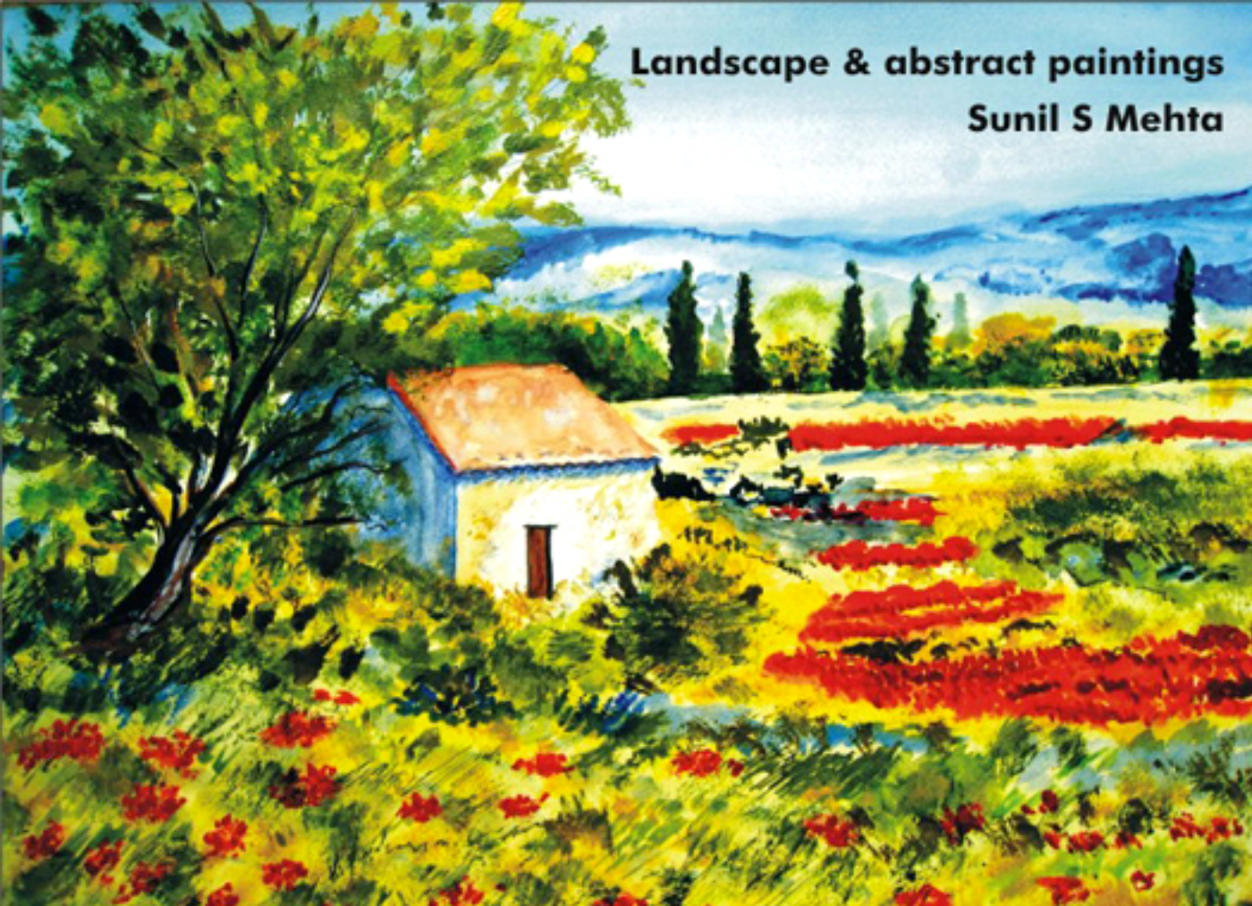
Landscape & abstract paintings Sunil S Mehta